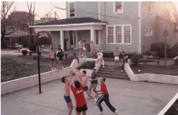
Beta-Pi undergraduates playing basketball in front of the old Tau Kappa Epsilon social quarters, spring 1985.