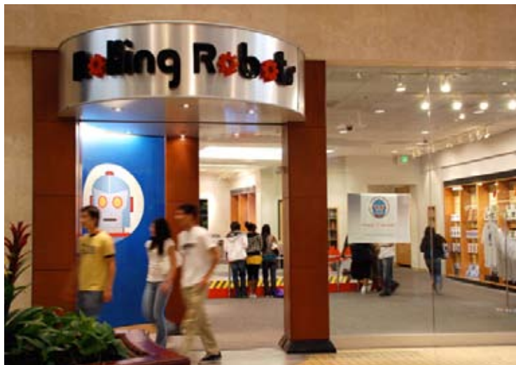
Rolling Robots opened its doors in May 2009 at the Del Amo Fashion Center in Torrance, California. The retail site allows people of all ages to build their own robots and compete in a “battle-bots” game.