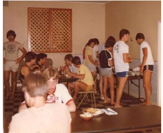
Dinnertime in the old social quarters, spring 1980.